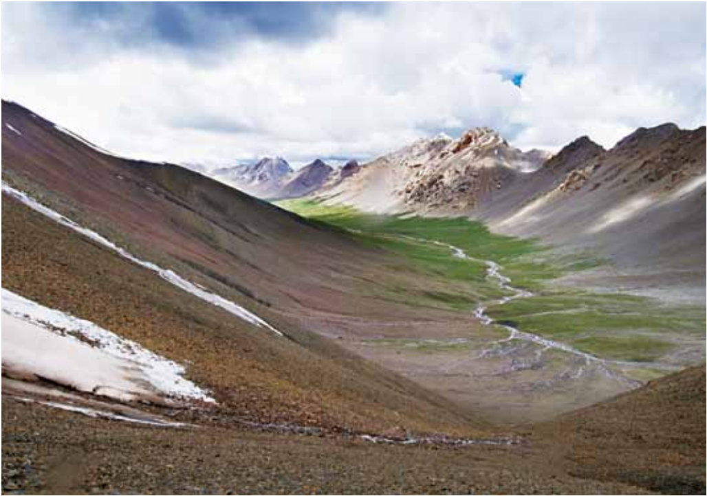
Stream from the new Mekong source flowing down to the first confluence.