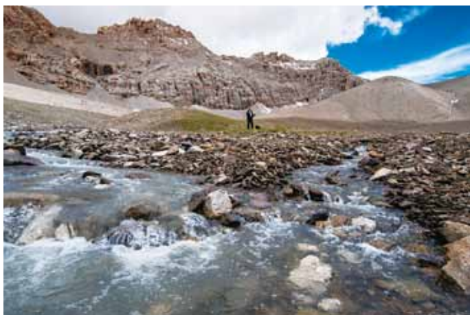
Fig. 2 The first confluence of the Mekong. The stream on the right flows from the Mekong source we discovered.