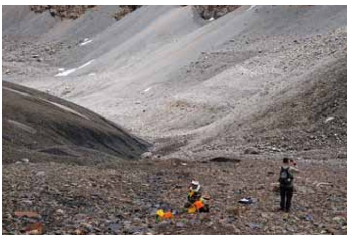
Fig. 3 Source of the lower stream. Photo in the direction of Jifu Mountain.