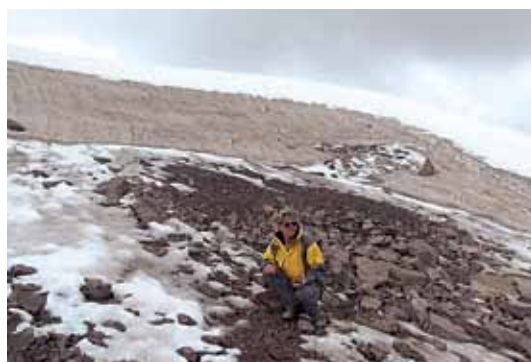
Bottom of the Glacier, right