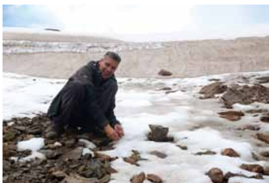
Bottom of the Glacier, left