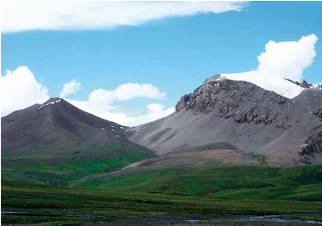
Fig. 5 View from the Gaoshanxigu valley. Jifu Mountain on the right, at the Mekong-Yangtze divide. The Mekong originates at the back of the mountain on the left, inside the Mekong basin.