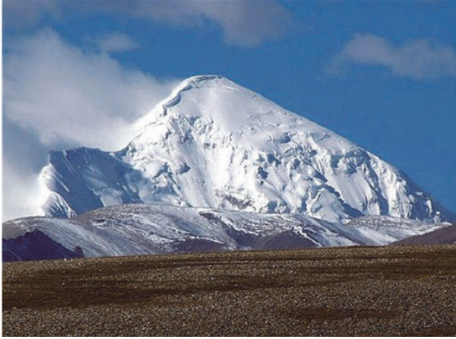
Qungmo Kangri 7048m E face, climbed