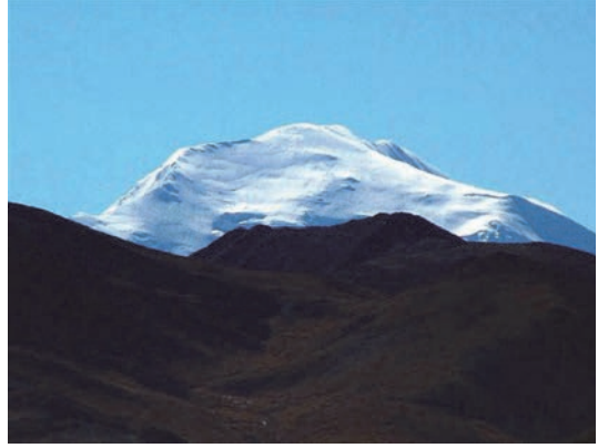
Kangto 7060m north face on McMahon Line, first climbed by Doshisha