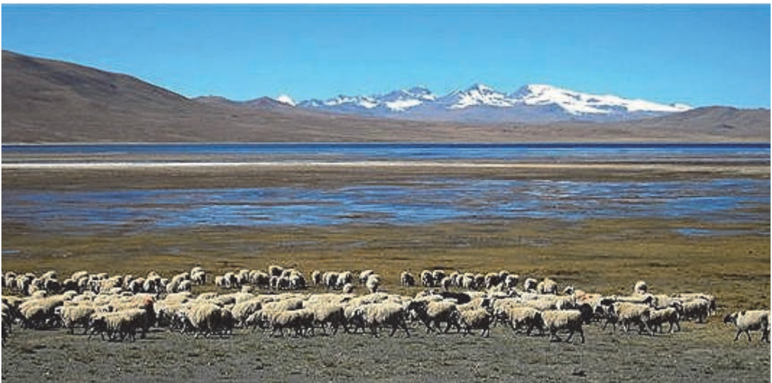
Lake Chigu 4600m and sheep

(From left) 下拉拉崗 Xialala Kang 6682m, 打拉日主峰 Tarlha Ri 6777m、6542m, East face, 東面、viewed from a pass (吉尔拉) 5130m to southwest. All peaks remain unclimbed.