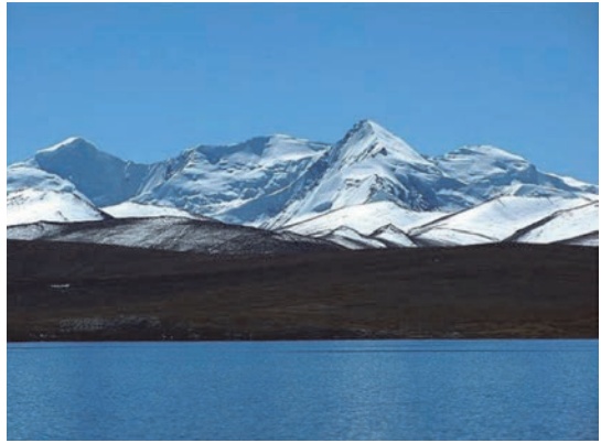
Unclimbed 6600 - 7000m Pks ranging to southwest from Kulha Kangri