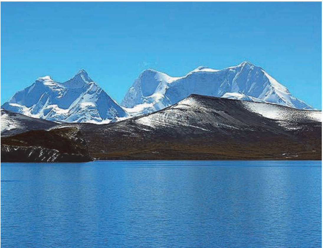
Karejiang Main 7221m NW face (left), Kulha Kangri I 7538m N face (right) and Yamu Yumco 4980m (all climbed)