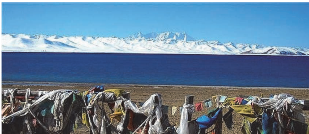
Nam Co 4718m & Nyainqentanglha West, N face, climbed