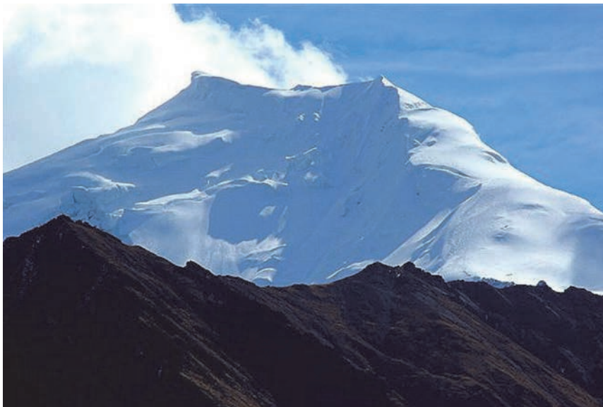
Bobonung massif 6152m W face, unclimbed, south of Nang Xian