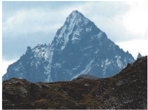
5700m Pk west face southeast of Meila Shan view from Meila Shan pass 5020m