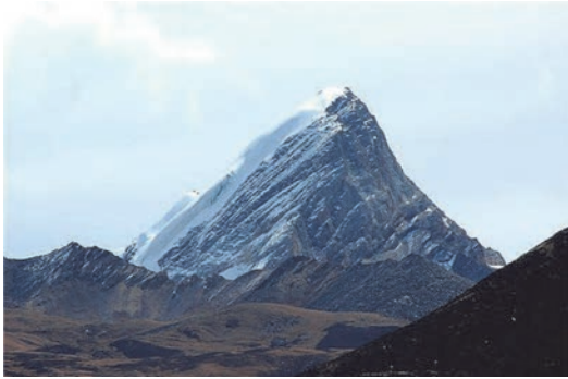
5964m Pk north face