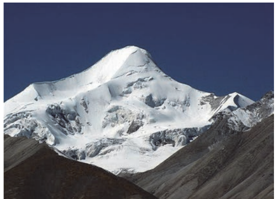
Samdain Kangsang 6590m E face, climbed