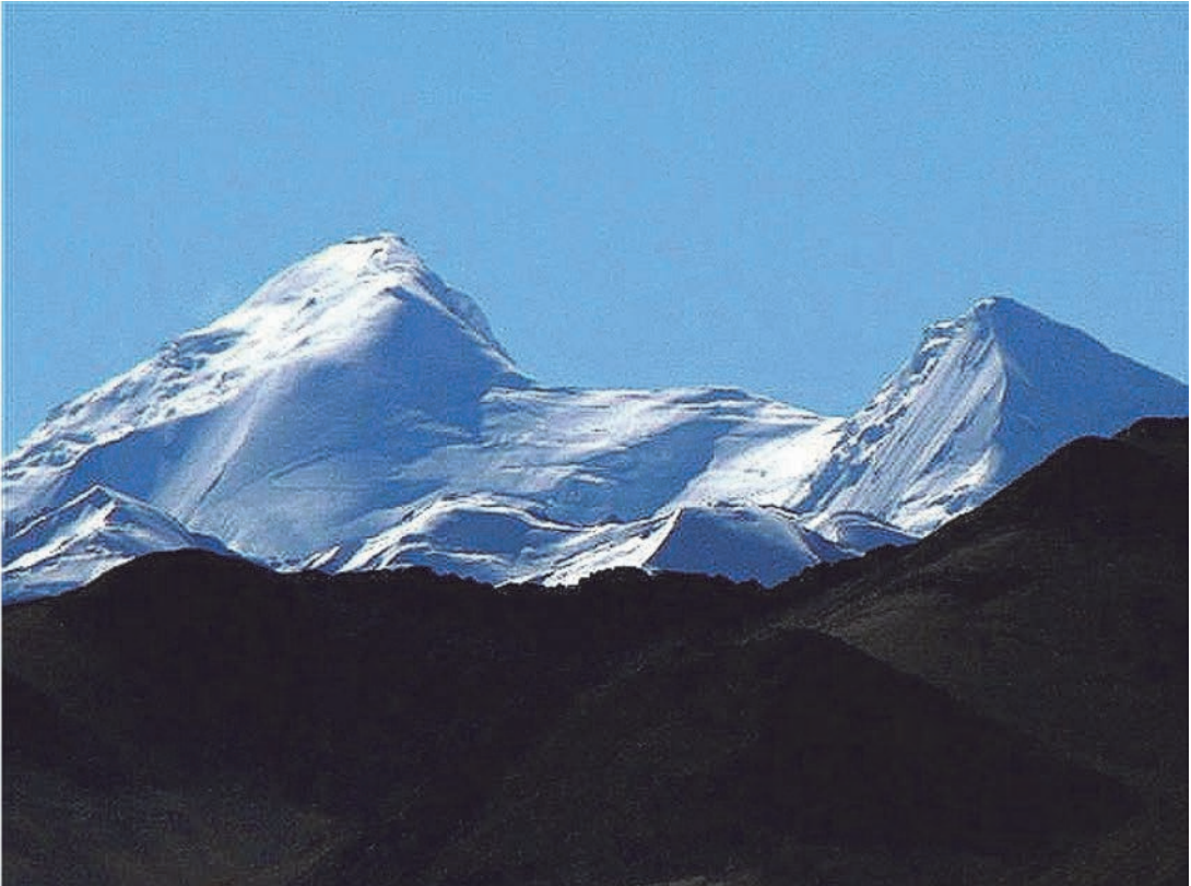
Chomo I 6878m (left) II 6733m (right) N face on McMahon Line, unclimbed