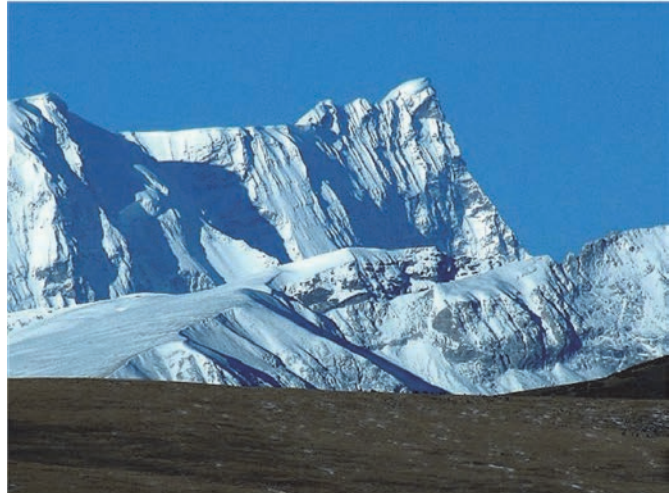
Nyainqentanglha I 7162m NE face, climbed