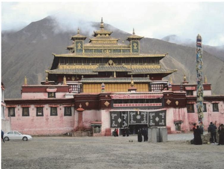
Historical Samye Monastery in Zetang