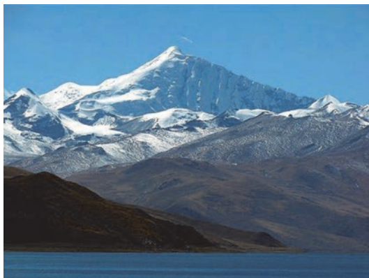
Nojinkangsang 7191m E face, climbed