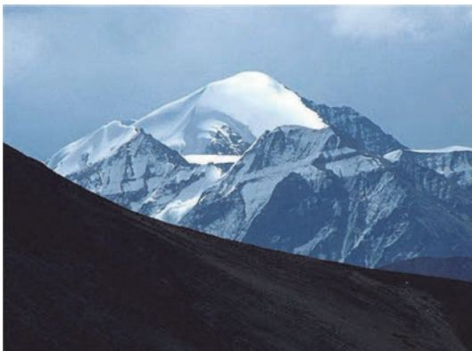
5794m Pk west face southeast of Meila Shan pass