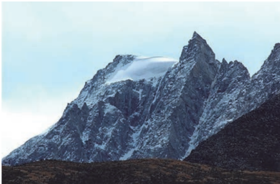
Holy mountains "Worde Kongge" 5725m north face