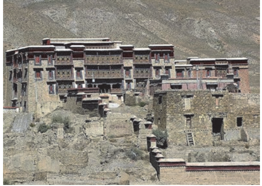
Old palace in Songqu