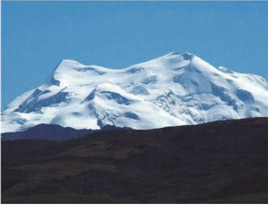
6505m Pk north of Cona, north face Unclimbed