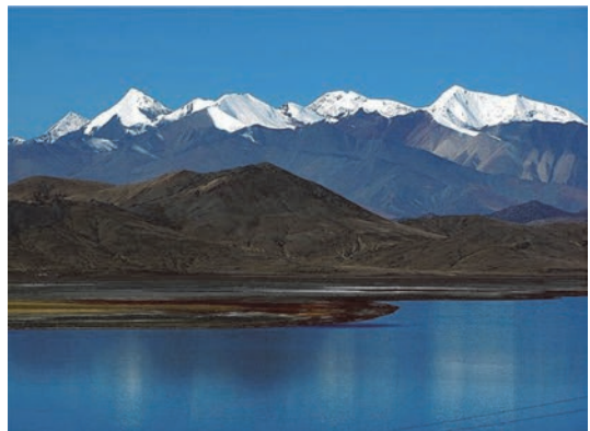
Monda Kangri 6425m N face, climbed