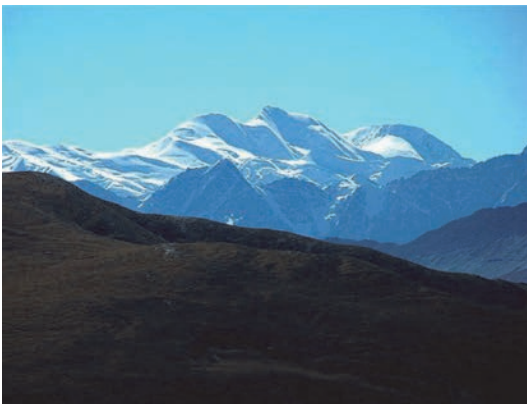
5960m Pk east of Lhunze, west face Unclimbed