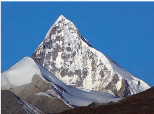
Golden Dragon 6614m W face, climbed