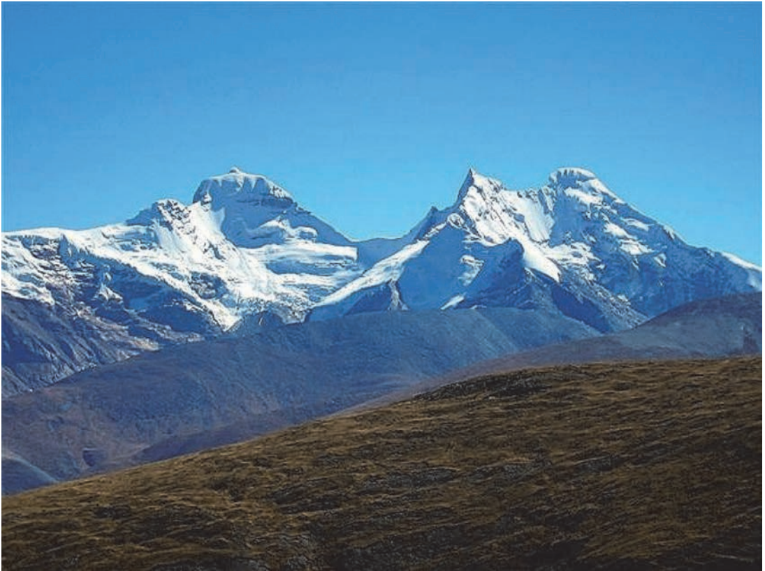
Yalaxianbo, Main peak 6635m (left) climbed, South peaks 6495m/6542m (right) unclimbed, west face