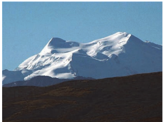
6505m Pk north of Cona, north face Unclimbed