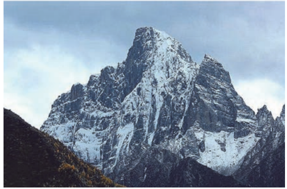
Rock Pk 6150m north face, unclimbed