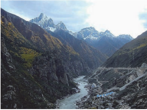
Yarlung Tsangpo and rock peaks on south bank