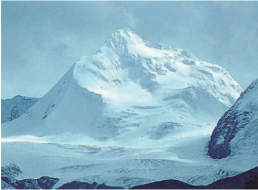
Qipula massif 6045m W face, unclimbed