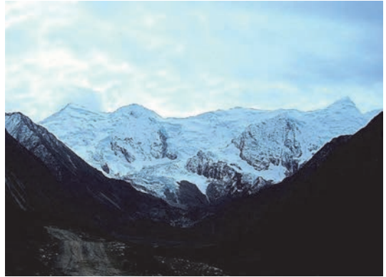
Bobonung massif 6000m N face, unclimbed