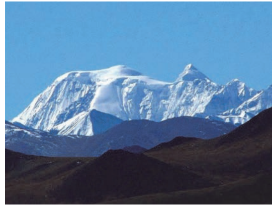
6000m Pks close to Bhutan border. All unclimbed.