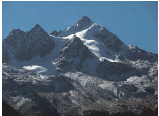
6060 Pk north face seen from Bahozhen