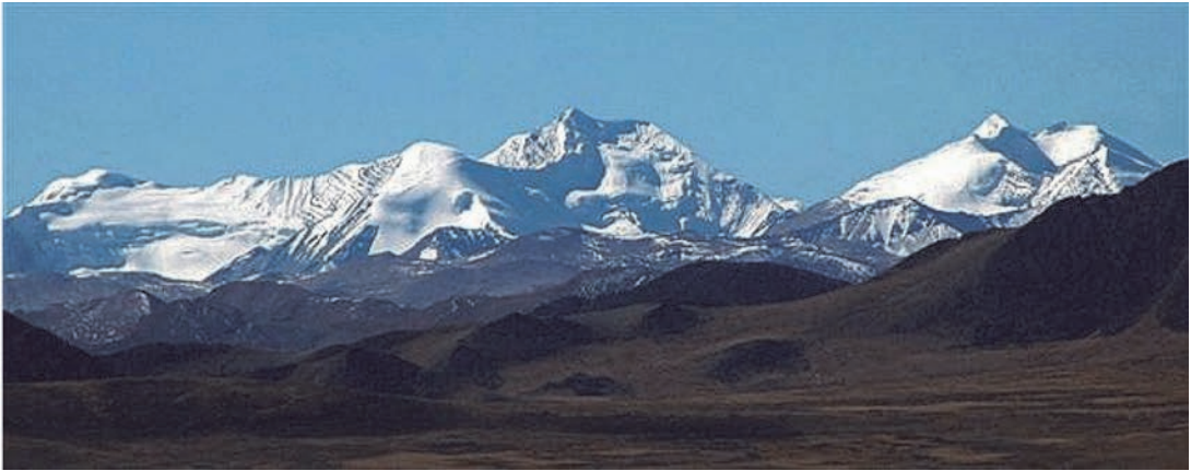
Pk 6100m+ N face 16km N of Bhutan (central), ca.6000m Pk (right), all unclimbed