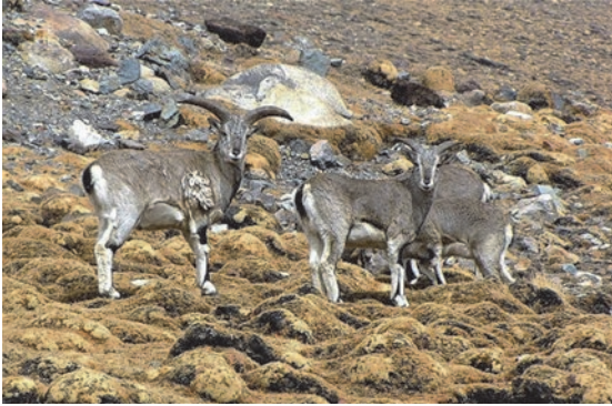
Blue sheep in Nyainqentanglha West