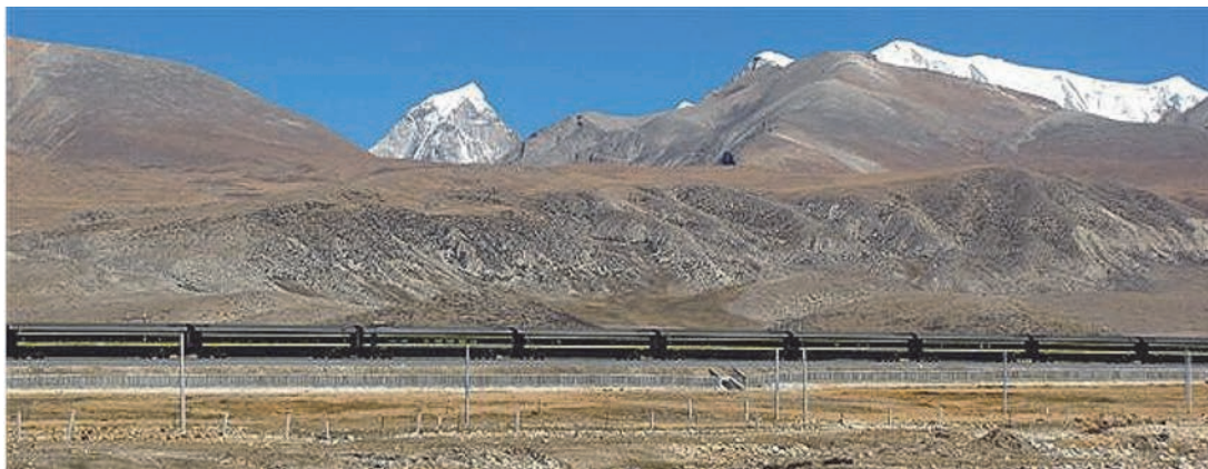
Qinghai-Tibet Plateau Railway