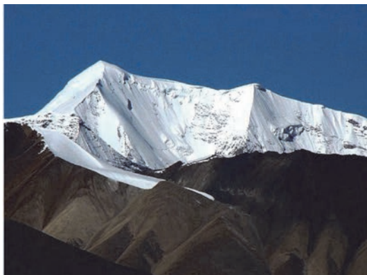
Kalung E face, climbed by Keio AC