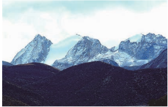
Holy mountains "Worde Kongge" 6000m north face