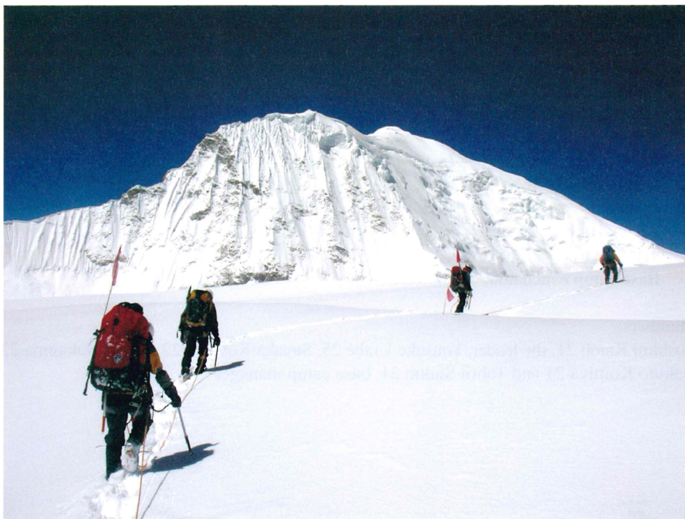
Panbari Himal—The summif (left) seen from 6,000m plateau