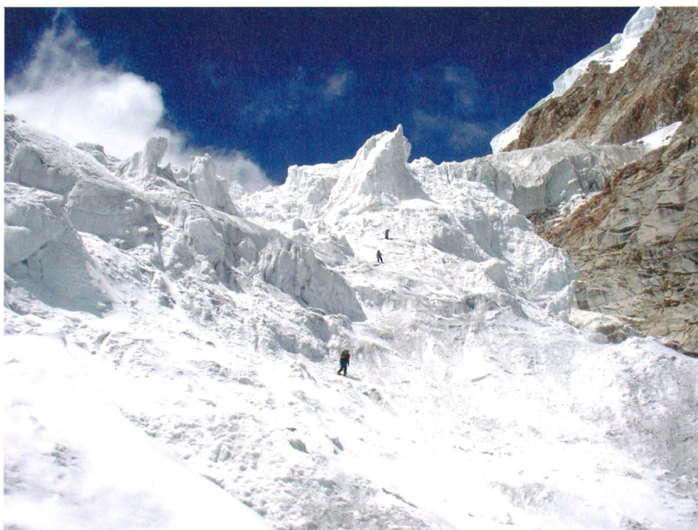
Panbari Himal—Ice fall at 5,600m