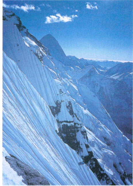
View from near C2. W face of Makalu is seen far away.