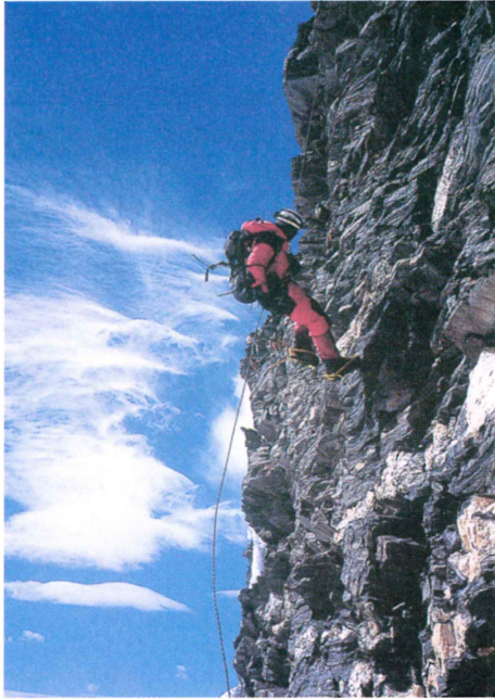
Route paving above C1.