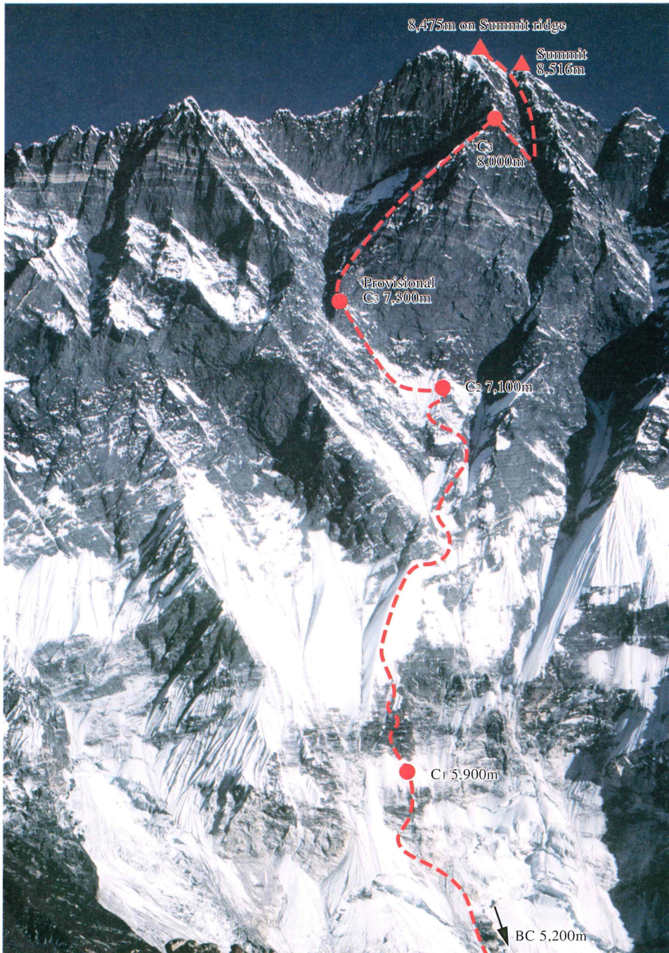
Overall view of the Lhotse South Face