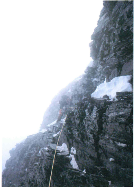
Traversing fragile rock wall at 8,350m to detour around the uppermost of couloir to the left