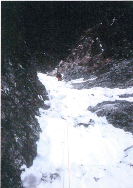
Climbing the upper part of couloir at 8,300m (Yellow rock wall in the uppermost of the couloir was detoured around to the left.)