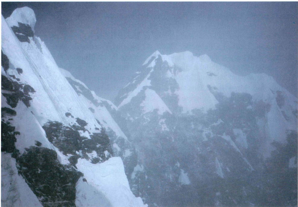
Top of Lhotse viewed from 8,400m just beneath the summit ridge